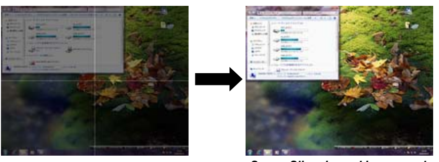
ScreenSlicer is working properly

* Aero Snap is a function incorporated with Windows 7 which arranges a window automatically by dragging it to the left or right edge of the screen.