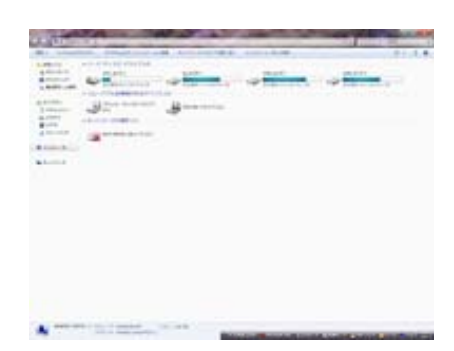
Aero Snap is working (The window has been maximized in this case, but the behaviour varies depending on the position of the cursor.)