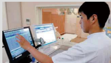
Touch-panel monitors that visually confirm operations are easy to use.