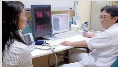
Patients find color monitors helpful for facilitating understanding in explanations.