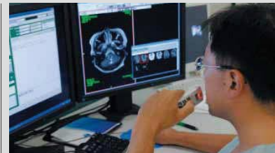
With digital images, a wide variety of information can be gleaned simply by changing viewing conditions.