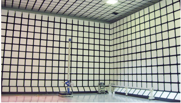
Conducting EMC performance tests in our own anechoic facilities

We develop and evaluate our products from the perspective of our customers from every conceivable viewpoint, starting with reliability and safety and including environmental compliance, energy saving, EMC performance, ergonomics, usability and service. In addition, we perform product longevity testing to be certain of how our products will perform over many years.