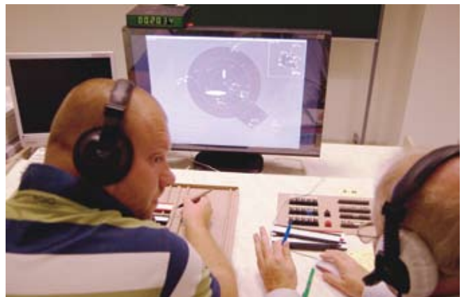
Flight simulator training at training center of ANS CR Prague (30" monitor FlexScan SX3031W)