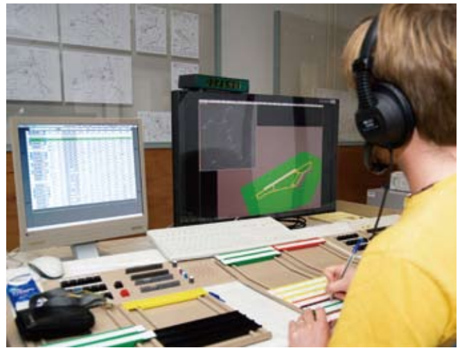
Flight simulator training at training center of ANS CR Prague (30" monitor FlexScan SX3031W)

"Last, but not least, I would like to highlight the cooperation of EIZO engineers who were flexible in tailoring monitors to our special requests and needs. They were able to provide us, in the relatively short time of a few months, with a concept and delivery of a high-quality visual solution."