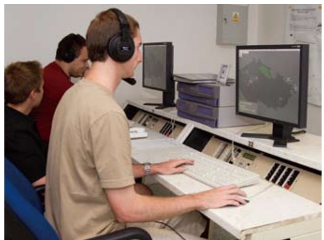
Flight simulator training at training center of ANS CR Prague (21" monitor FlexScan S2100)