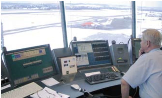
Aerodrome control tower (TWR) at Brno-Turany Airport

“We decided to use EIZO monitors because of the excellent references from other monitoring centers, but also because of our own experience using the EIZO monitors that we installed in our security center and technical server facilities. Currently we use EIZO’s 24" FlexScan S2411W and 24" FlexScan HD2441W monitors for radar and secondary information display within the aerodrome control tower (TWR) facility. The monitors fulfill our demanding 24-hour operating requirements and allow us to vary the brightness settings over a wide range which contributes to significantly reduced controller eye strain and fatigue.”